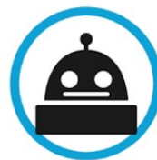
STEAM and Innovation