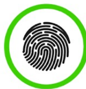
Personalized Learning and Transforming Student Assessment