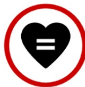
Equity, Justice and Belonging