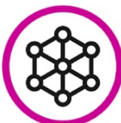
Culture of Coaching